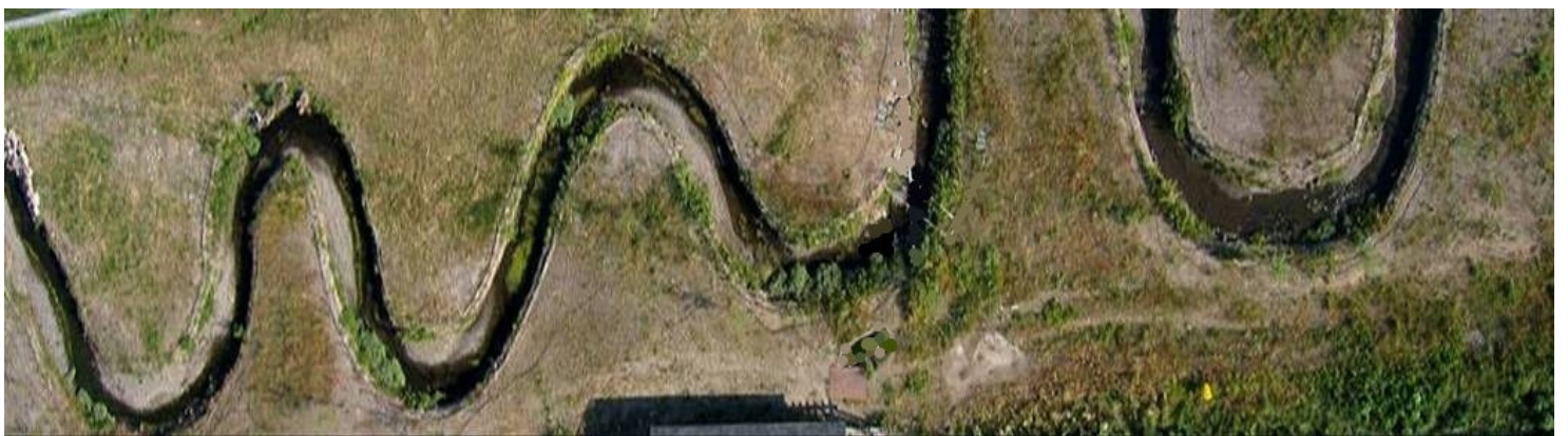
Figure 3: Kite Aerial Photograph of 2004 Restoration from Union Pacific Railroad Tracks to 5 th Street